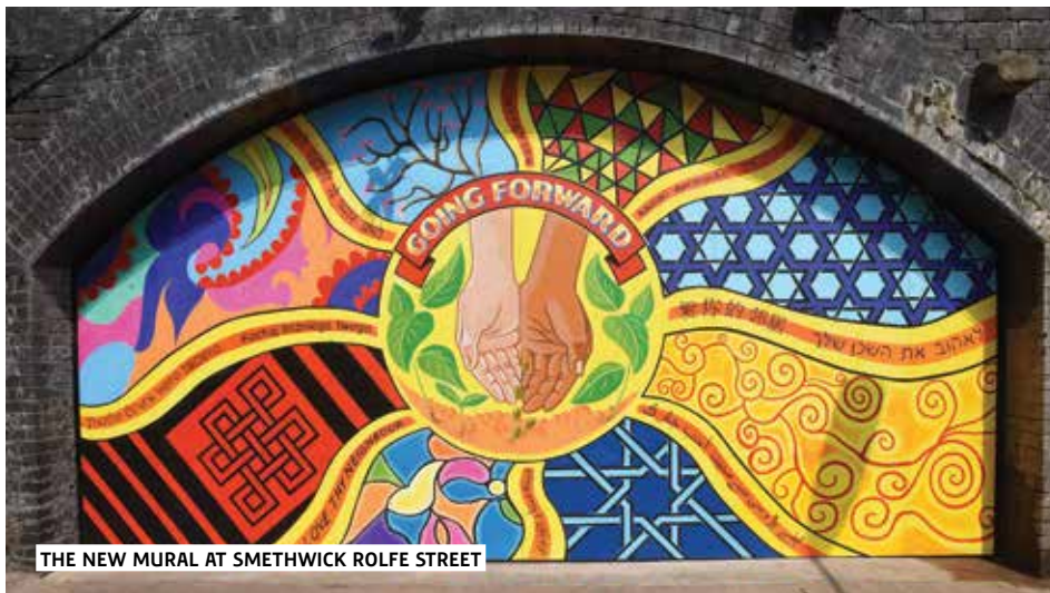
THE NEW MURAL AT SMETHWICK ROLFE STREET

Faye Lambert, Head of Community Rail at London Midland, said: "These projects are great examples of how people of all ages can make a real difference to their area by enhancing their local station."